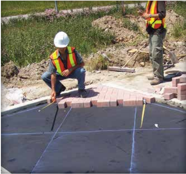
Figure 10. Cut pavers are added along the edges.

Best application results are typically achieved using a synthetic paint roller with a short nap. Once applied the tack coat should not be disturbed and should be allowed to cure before covering with the setting bed material. As the asphalt emulsion cures it should turn from a brown to black color (Figure 3). This may take a few hours depending on weather conditions. When using SS-1 and SS-1h asphalt emulsions the temperature should be between 70 and 160° F (20 to 70° C) to allow for proper curing. Asphalt tack coats are recommended for vehicular applications. They are typically not required in pedestrian applications.