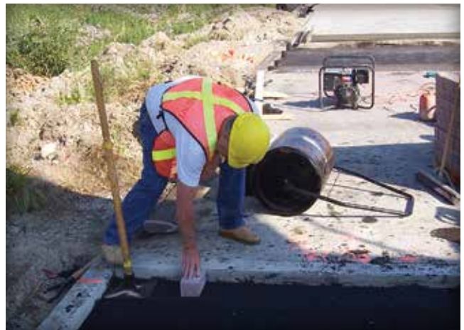
Figure 7. The compacted bedding elevation at the edge is checked with a paver.