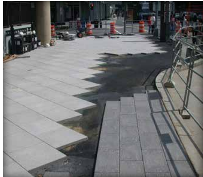
Figure 18. Paving slabs adhered to a bitumen-sand bedding in a Washington, DC, sidewalk.