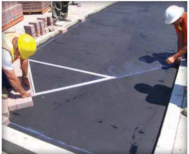
Figure 9. Perpendicular chalk lines are snapped and the pavers placed on the adhesive after the neoprene-asphalt adhesive dries (cloudy black surface).