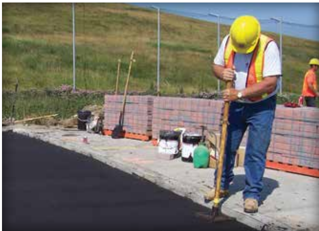
Figure 6. A hand tamper is used to compact in areas that cannot be reached with the roller compactor.