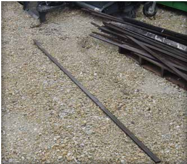
Figure 17. On larger projects, 1/2 in. (13 mm) thick steel screed bars are placed on the concrete base to ensure a uniform bitumen-sand bedding thickness.