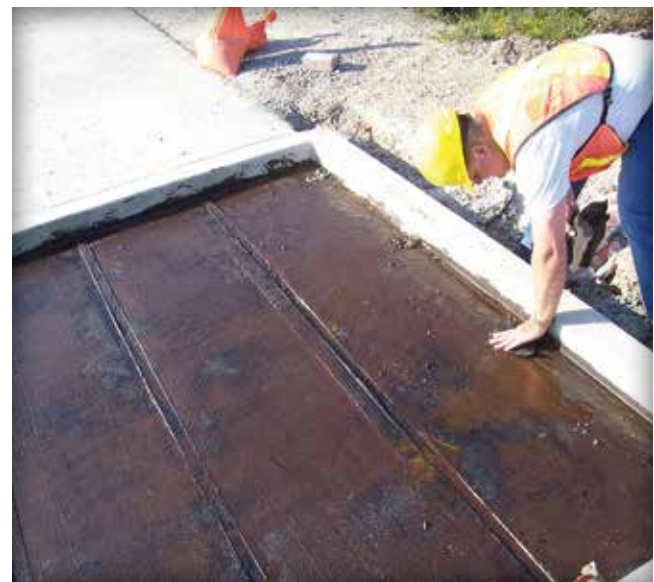
Figure 3. Confirming the tack coat has cured and is no longer wet to the touch.