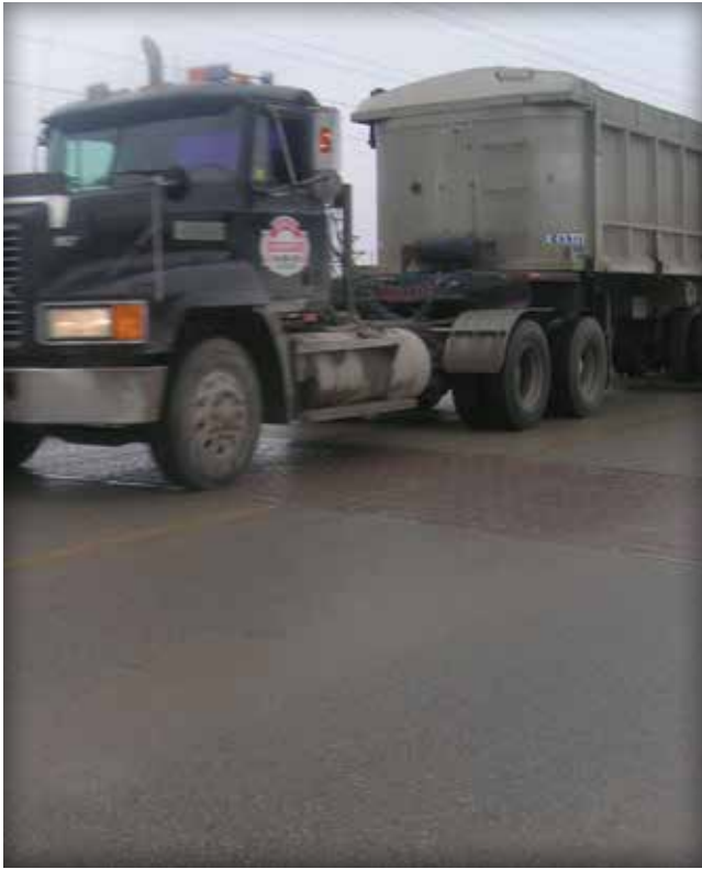
Figure 13. Crosswalk in use under heavy traffic.

ers are in place including cut units, sand is swept into the joints and pavers are compacted until the joints are full (Figures 11 and 12). For more efficient work, sand sweeping and compaction can be simultaneous. Unlike sand-set pavers, there is no need to compact the pavers without sand in the joints first. When completed, the pavement can accept traffic loading immediately (Figure 13).