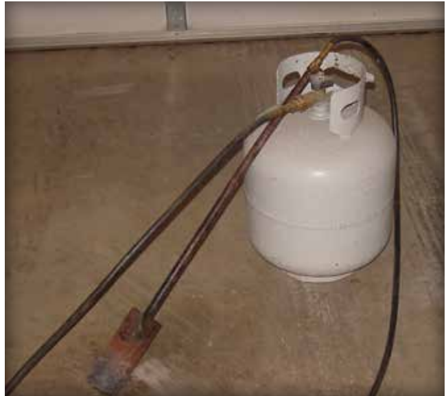
Figure 16. Occasionally, uneven bedding surface occurs and it is necessary to re-heat the bitumen-sand bedding with a propane heater tool.