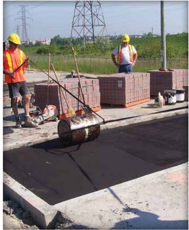
Figure 14. A water-filled roller compactor for compacting the bitumen-sand bedding.

Specialty Tools —Some specialty tools are required to successfully install bitumen-sand set pavers. For example, Figure 14 shows a roller modified with a long handle welded or bolted to the frame. The drum of the roller should be smooth with no rust, preferably with sharp edges (not rounded). Other specialty tools are shown in Figures 15, 16 and 17.