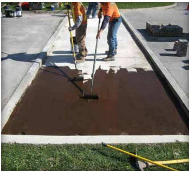
Figure 2. Emulsified asphalt tack coat is applied to a concrete base prior to applying the bitumen-sand mix.