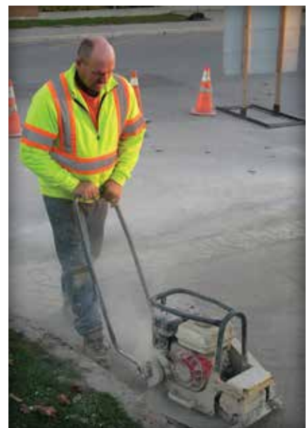
Figure 12. Once the pavers are in place, the joints are filled with dry joint sand and the surface is compacted.

A thin layer of neoprene-asphalt adhesive is then applied with a squeegee to the top of the bedding layer, and allowed to cure (typically 1 to 2 hours). Adhesives with a high viscosity are applied with a straight edged towel as shown in Figure 8. Adhesives with a low viscosity can be applied with a squeegee. The adhesive takes a hazy appearance when ready to mark baselines and place the concrete pavers (Figure 9). Only enough adhesive should be applied that will be covered with pavers in a day's work. Figure 10 shows the paver installation. Once the pavers are placed on the adhesive, they are very difficult to remove. If removed, they can pull up the adhesive and bitumen-sand bedding under the paver. Once all the pav-