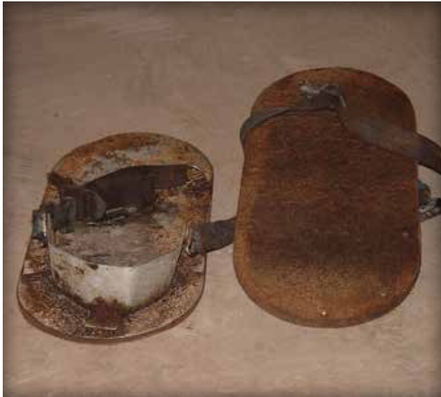
Figure 15. Walking on the hot bitumen-sand bedding with regular construction grade, steel-toed boots is discouraged. For limited walking on this layer, workers should wear boot sole covers shown here that resist damage and better distribute weight to prevent dentations.