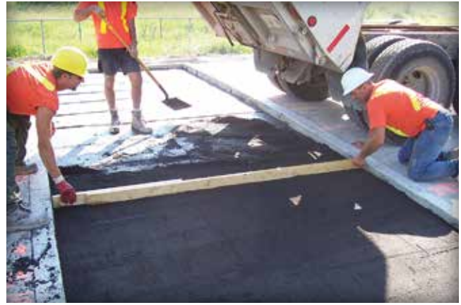
Figure 5. While the bitumen-sand is still hot, it is screeded to an uncompacted thickness of about \frac{3}{4} in. (20 mm).