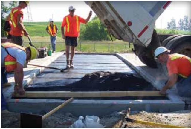
Figure 4. The hot bitumen-sand bedding material is dumped from a truck onto the concrete base.