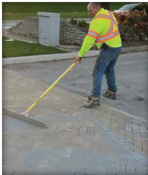
Figure 11. Sweeping in joint sand

The hot bitumen-sand bedding layer is placed, screeded to about \frac{3}{4} in. (20 mm) thick and compacted while remaining above 250° F (120° C) (Figures 4 and 5). This layer typically compacts about \frac{1}{8} in. (3 mm). The depth of this layer must be consistent. If the area does not have a curb to support a screed, screed bars are placed directly on the concrete base to guide the screed.