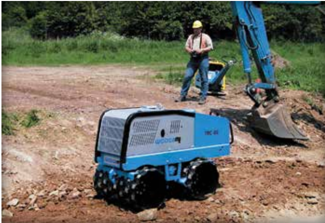
Figure 2. Compacting the soil subgrade.