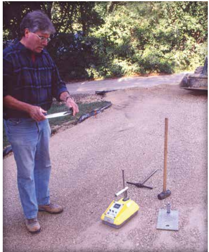
Figure 5. Density testing of the aggregate base with a nuclear density gauge.

Many localities determine base thickness with the 1993 Guide for the Design of Pavement Structures published by the American Association of State Highway and Transportation Officials (AASHTO). The AASHTO procedure calculates the structural number (SN) of the strength coefficients of each base and pavement layer. The SN is determined by assessing the traffic loads, soils, and environmental factors (e.g., drainage, freeze-thaw). The layer coefficient recommended for 3 1 / 8 in. (80 mm) thick pavers on 1 in. (25 mm) bedding sand is 0.44 per inch (25 mm), i.e., the SN = 4^{1/8} \times 0.44 = 1.82 . Base thicknesses can be readily determined by using the charts in ICPI Tech Spec 4—Structural Design of Interlocking Concrete Pavement for Roads and Parking Lots or ICPI Structural Design Software. This software is available for free download on www.icpi.org .