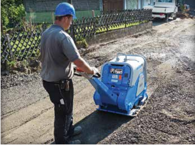
Figure 4. Base compaction with a reversible plate compactor.