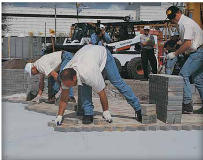
Figure 7. Placing the concrete pavers.

Edge restraints are a key part of interlocking concrete pavements. By providing lateral resistance to loads, they maintain continuity and interlock among the paving units. Aluminum, steel, plastic, or concrete are typical edge restraints. Consult ICPI Tech Spec 3 on edge restraints for recommendations on applications and construction.