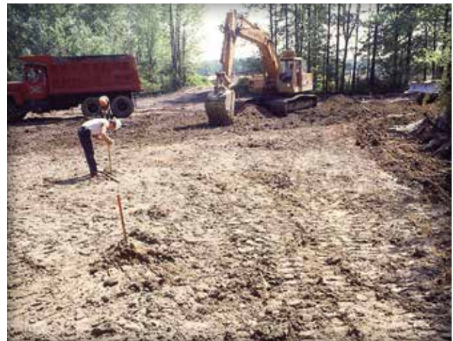
Figure 1. Excavation of the soil subgrade and placing grade stakes.

Prior to excavating, check with the local utility companies to ensure that digging does not damage underground pipes or wires. Many localities have one telephone number to call at least two days before excavation for marking utility line locations. Overhead clearances should be checked so that equip-