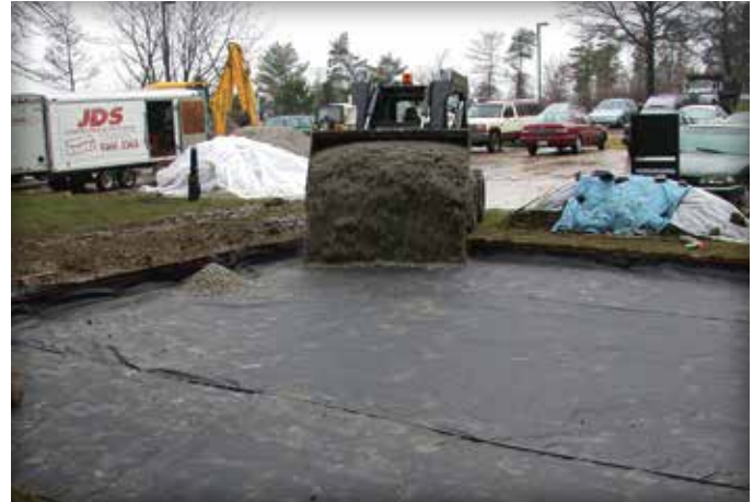
Figure 3. Application of the geotextile under aggregate base.

ment does not interfere with wires. Site access by vehicles and equipment should be established so that the job can be built without delays.