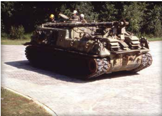
Figure 13. The completed paved area from Figure 12 receives tank traffic at the U.S. Army Proving Grounds in Aberdeen, Maryland.

ICPI Tech Spec 9—A Guide Specification for the Construction of Interlocking Concrete Pavement helps translate construction methods and procedures described here into a construction document. Tech Spec 9 provides a template for developing project-specific materials and installation specifications for