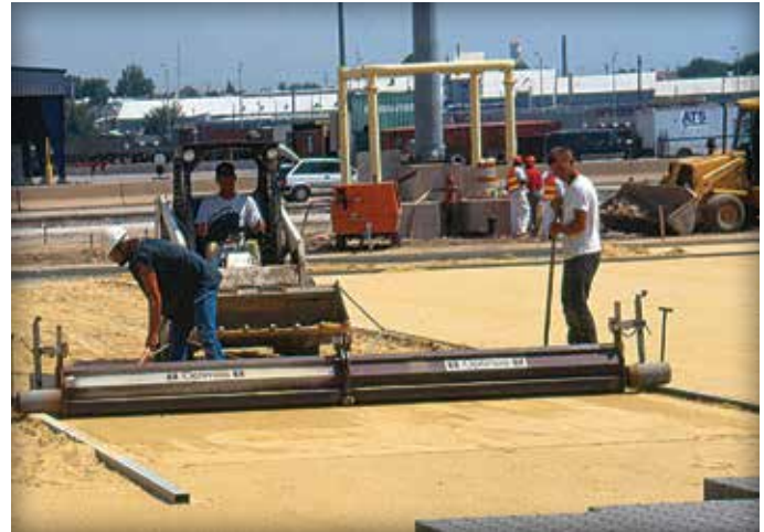
Figure 6a & 6b. Screeding the bedding sand.

Like compaction of the soil subgrade, adequate compaction of the base is critical to minimizing settlement of interlocking concrete pavements. See Figure 4. Special attention should be given to achieving compaction standards adjacent to edge restraints, catch basins and utility structures. When spread and compacted, the aggregate base should be at its optimum moisture. Bases for pedestrian areas and residential driveways should be compacted a minimum 98% of standard Proctor density. For vehicular areas, compaction should be at least 98% of modified Proctor density as determined by ASTM D1557, or AASHTO T180. While the highest percentage compaction (100%) is preferred, it may not be achievable on weak or saturated soils. Density measurements of the compacted base should be made with a nuclear density gauge or other methods approved by the local, state or provincial transportation department. See Figure 5. Unless otherwise specified, the compacted thickness of individual lifts should be +3/4 in. to -1/2 in. (+19 mm to -13 mm). Maintaining consistent lift thickness during compaction will help achieve consistent density. Variation in