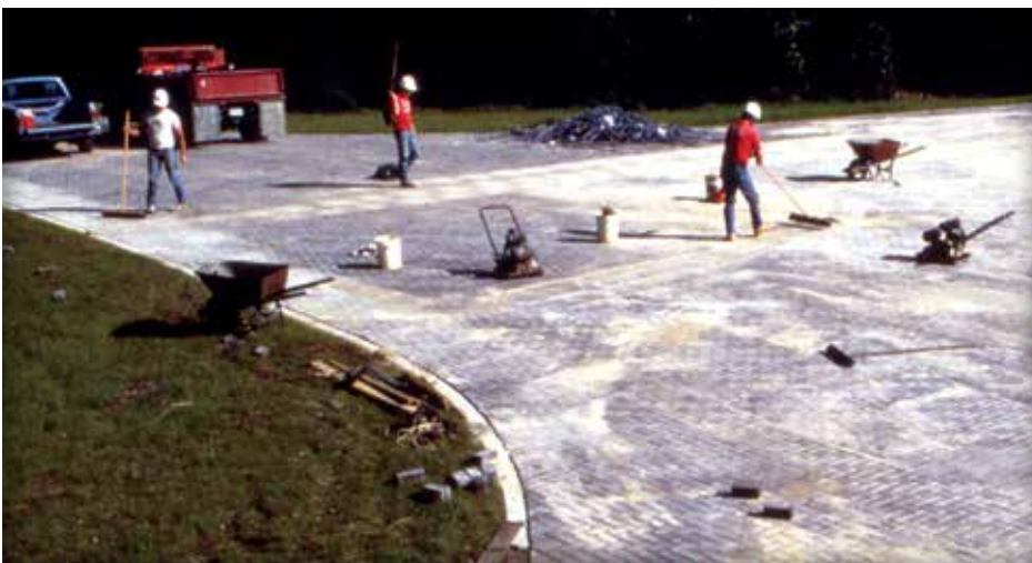
Figure 12. Removing excess sand from the finished surface will make the pavement ready for traffic.

sand is wet, it should be spread on a clean, hard surface to dry before being spread on the pavers and compacted into the joints. Joint sand may be finer than the bedding sand to facilitate filling of the joints like a sand meeting ASTM C144 or CSA A179 requirements. See Table 6. Bedding sand also can be used to fill the joints, but it may require extra effort in spreading and compacting. Compaction should be within 6 ft (2 m) of an unrestrained edge or laying face. All pavers within 6 ft (2 m) of the laying face should have the joints filled and be compacted at the end of each day. Excess sand is then removed. See