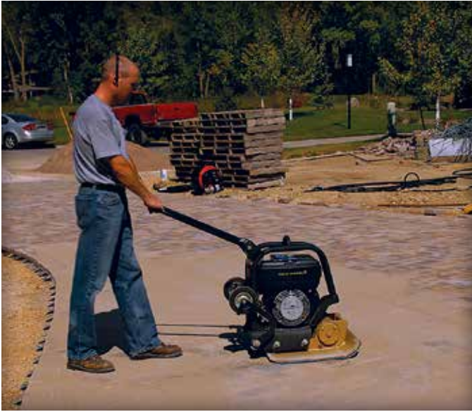
Figure 11. Vibrating sand into the joints.

screeded it should not be disturbed. Sufficient sand is placed and screeded to stay ahead of the placed pavers. Powered screeding machines that roll on rails and asphalt spreading machines adapted for screeding sand have been successfully used on larger installations to increase productivity.