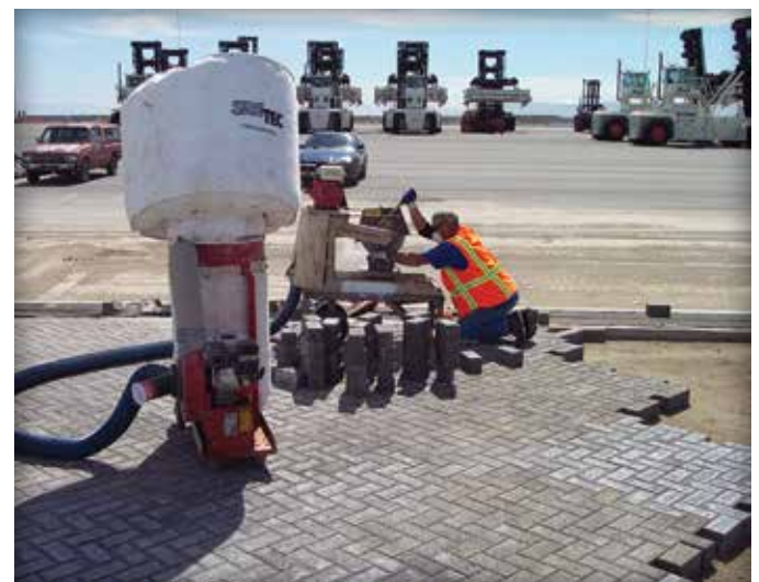
Figure 8. Saw cutting pavers.