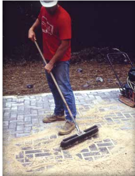
Figure 10. Spreading the joint sand.

Edge restraints must be set at the correct level, especially if the tops of the restraints are used for screeding the bedding sand. Their elevations should be checked prior to placing the sand and pavers. A minimum of 1 in. (25 mm) vertical restraining surface should be in contact with the side of the paver to adequately restrain it. For heavy duty application a greater restraining surface may be warranted. Edge restraints are typically installed before the bedding sand and pavers are laid. However, some restraints can be secured into the base as the laying progresses.