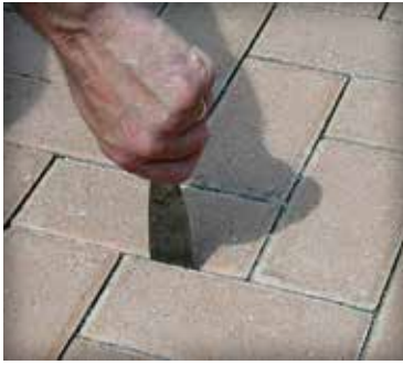
Figure 14. A simple test with a putty knife checks consolidation of the joint sand.

pavers and the skill of the vibrating plate operator.