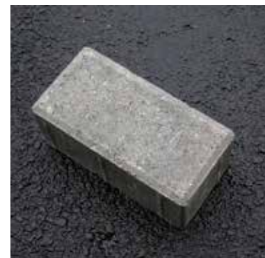
Figure 4. Spacer bars are small nibs on the sides of the pavers that provide a minimum joint spacing into which joint sand can enter.

A key aspect of this guide specification is dimensional tolerances of concrete pavers. For length and width tolerances, ASTM C936 allows \pm 1/16 in. ( \pm 1.6 mm) and CSA A231.2 allows \pm 2 mm. These are intended for manual installation and should be reduced to \pm 1.0 mm (i.e., \pm 0.5 mm for each side of the paver) for mechanically installed projects,