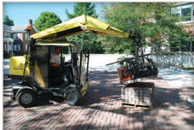
Figure 1. Mechanical installation of interlocking concrete pavements (left) and permeable units (right) is seeing increased use in industrial, port, and commercial paving projects to increase efficiency and safety.