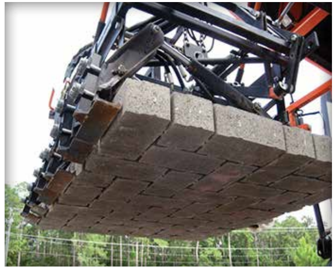
Figure 3. A cluster of pavers (or layer) is grabbed for placement by mechanical installation equipment. The pavers within the cluster are arranged in the final laying pattern as shown under the equipment.

A key component in the plan is a method statement by the manufacturer that demonstrates control of paver dimensional tolerances. This includes a plan for managing dimensional tolerances of the pavers and clusters so as to not interfere with their placement by paving machine(s)